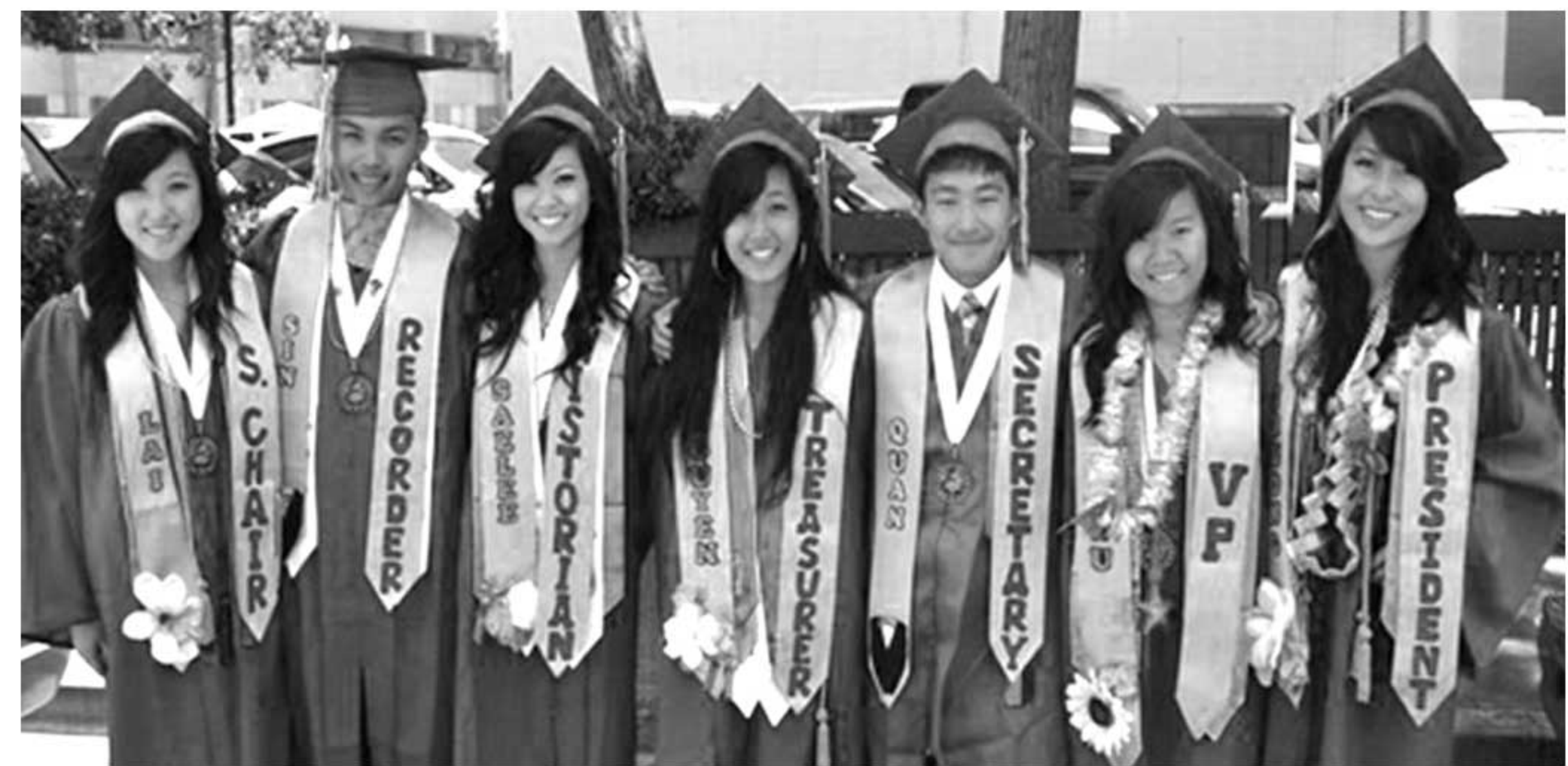
Oakland High School Class of 2014 Senior Recognition Ads

We know you are proud of our seniors! Senior Recognition Ads are a great way to show exactly how proud you are. Proceeds from Senior Recognition Ad sales are used to support Oakland High School's Yearbook Program.